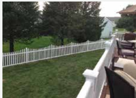
Open Fence No Conditional Use Permit required

If you have any further questions or comments in regards to fences, or any Planning and Zoning requests, please contact the Community Development Department during normal business hours 513-563-0033. The staff is available to respond to your needs.