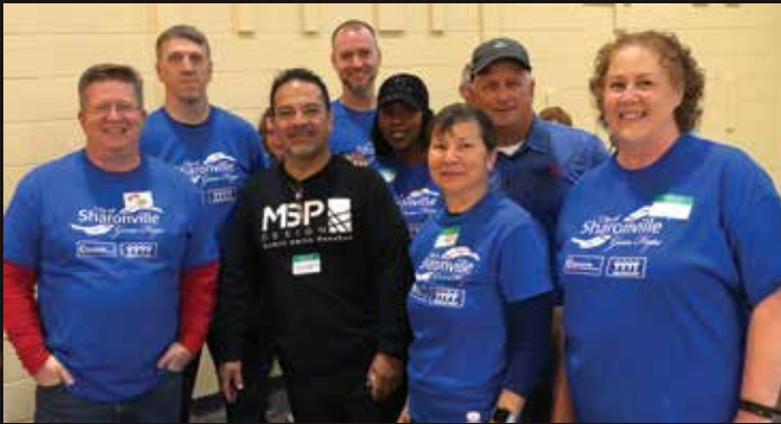
Kevin Hardman, Mayor

Named #7 Nationwide! Congratulations to Sharonville Mayor Kevin Hardman for being an Engaging Local Government Leader (ELGL) Traeger award winner! The list ranks energetic local government leaders celebrating everything that's good in local government. The 2019 ELGL Traeger Award list includes 100 local government influencers working at all levels in local government, across the United States and the United Kingdom. Mayor Hardman is recognized for his creation of Sharonville Gives, a unique program allowing city workers to volunteer at various organizations, and numerous City infrastructure projects such as a new police station, fitness center expansion, renovations to City Hall and renovation of Fire Station 87