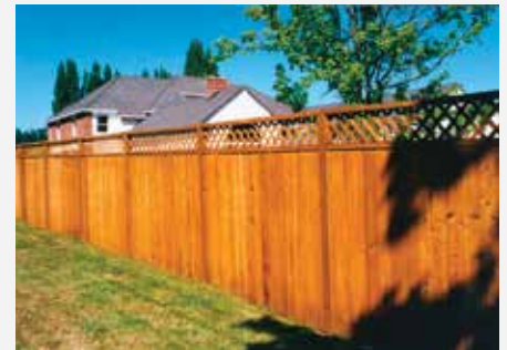
Privacy (solid) Fence Conditional Use Permit required